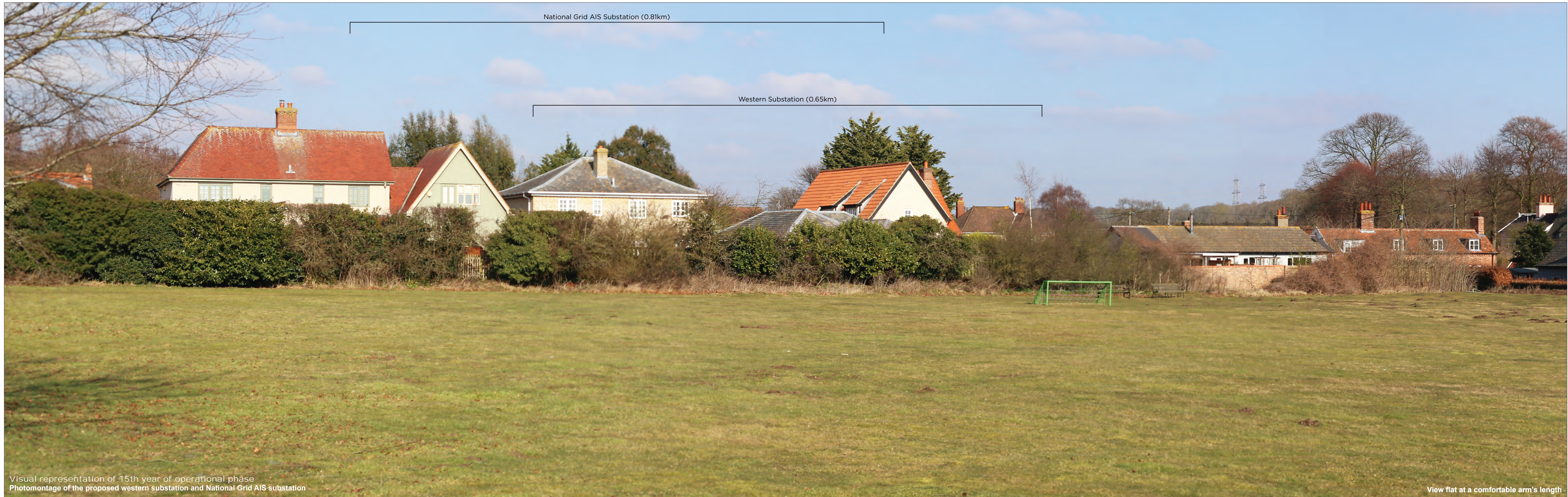
Visual representation of 15th year of operational phase Photomontage of the proposed western substation and National Grid AIS substation