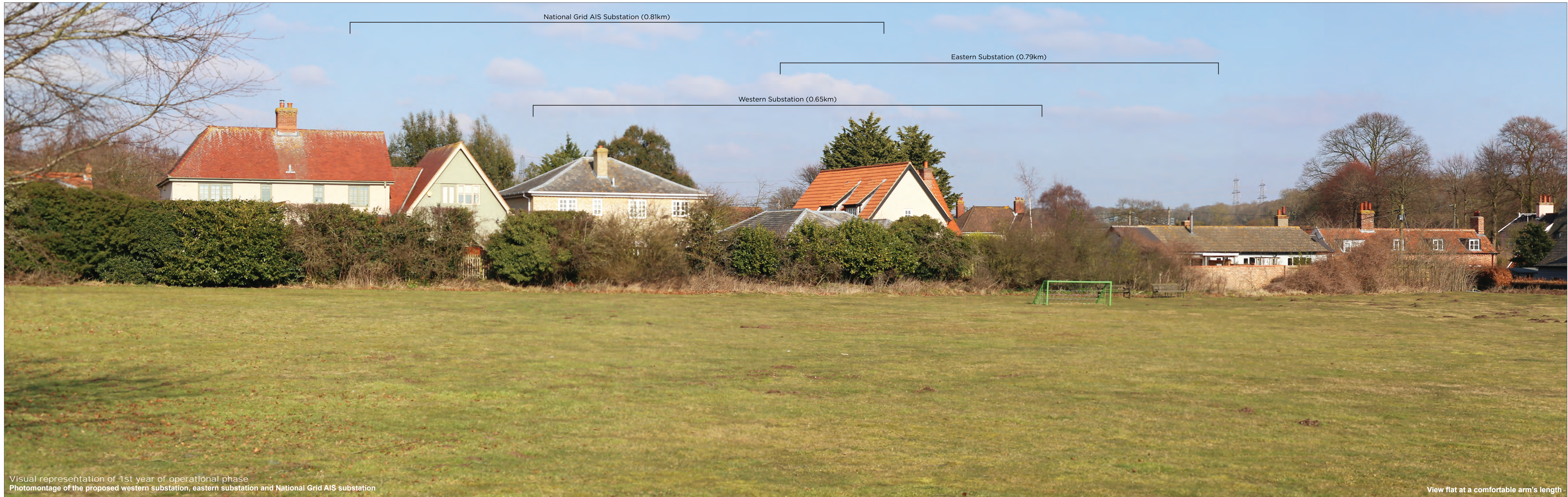
Visual representation of 1st year of operational phase Photomontage of the proposed western substation, eastern substation and National Grid AIS substation